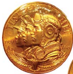
Congressional Gold Medal

Having the reputation of few bomber losses, the Tuskegee Airmen escorted almost 200 bombing missions during World War II. Flying P39 Air-a-Cobras, P40 Warhawks, P47 Thunderbolts and P51 Mustangs they defeated 112 enemy aircraft in aerial combat, demolished numerous enemy installations and badly crippled one enemy destroyer.